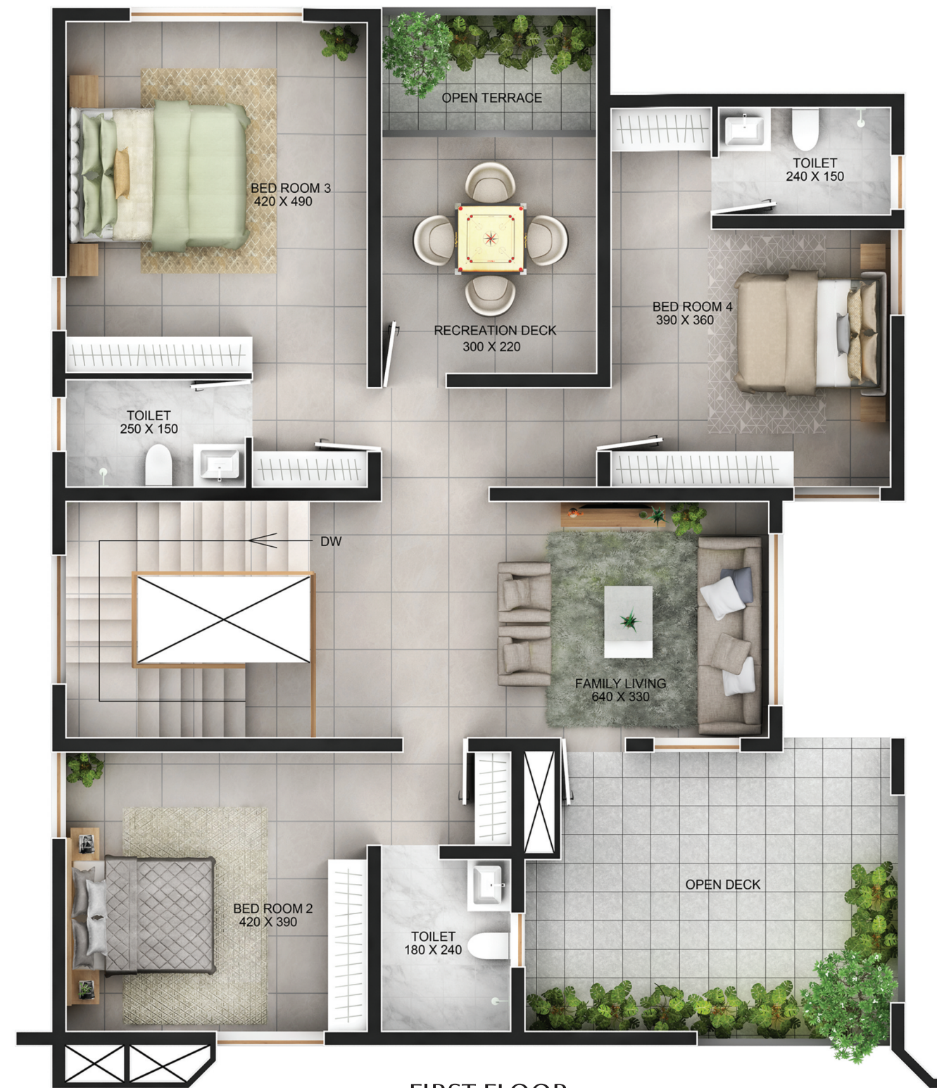
FIRST FLOOR 1443 Sq. Ft.