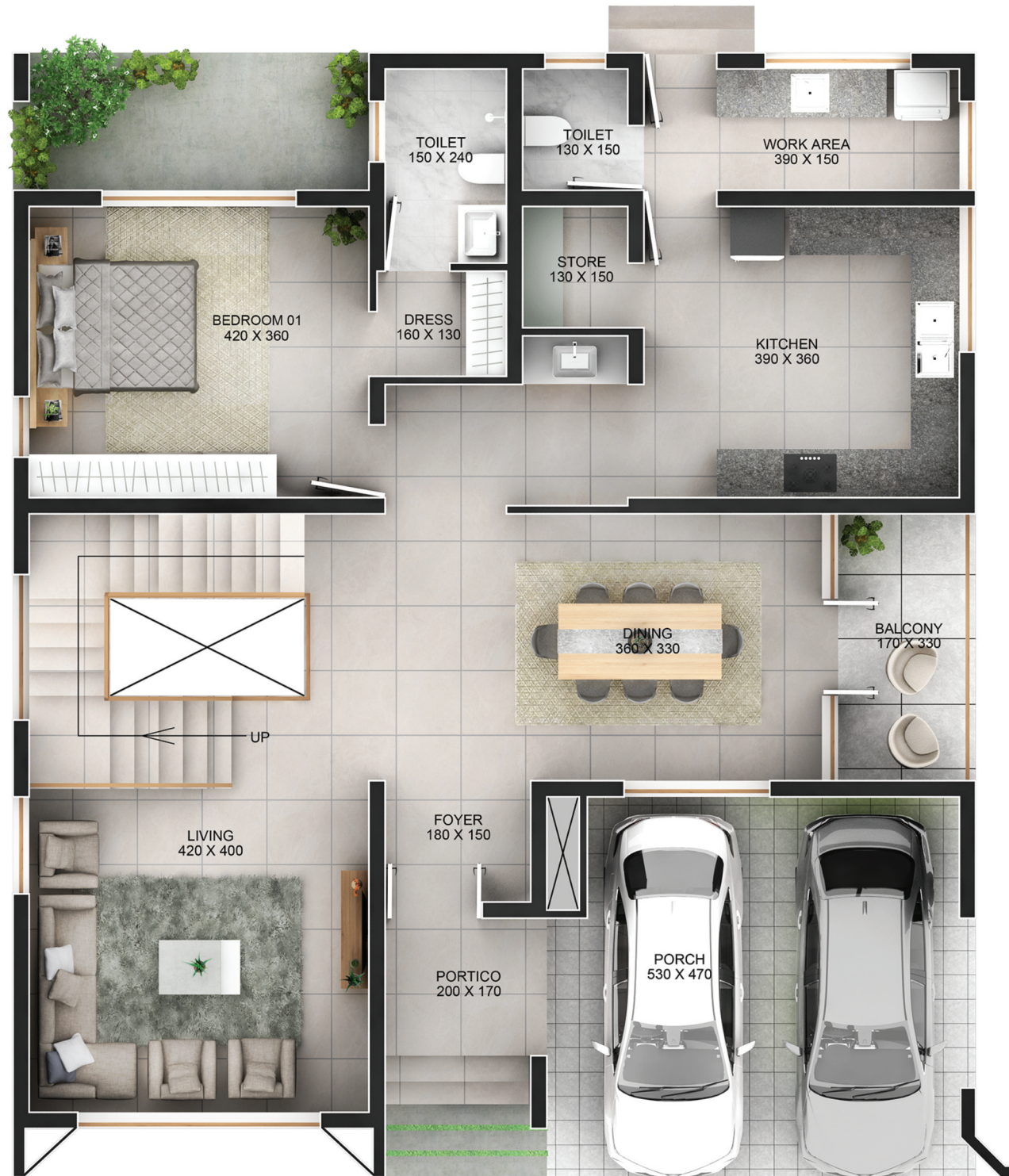
GROUND FLOOR 1657 Sq. Ft.